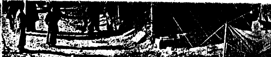
The housing shortage in Israel makes it necessary to accommodate numbers of immigrants in temporary shelters such as this tent camp. Some 70,000 are still living in barracks and tents although a large housing program is under way.

cal reports to the ZOA in that opening shot of the campaign. Dr. Silver attacked official quarters in Washington, not sparing the highest levels, for their hush-hush and do-nothing policies which were keeping the doors of Palestine closed and entrapping in horrible doom millions of Europe's Jews. With justifiable sarcasm, he uttered the now famous sentence, "The tragic problems of the Jewish people in the world