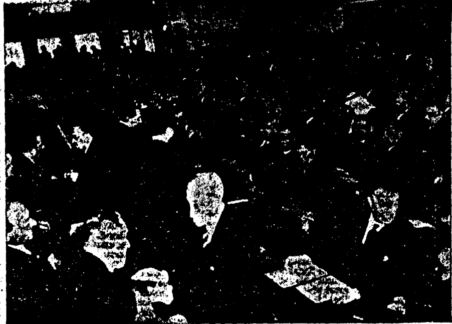
Israel's parliament, the Knesset, photographed before the opening of one of its recent sessions.

Speakers in the Knesset go to the rostrum in the French manner to make their speeches. The amount of time allotted to debate on any one bill is decided in advance, and each party receives