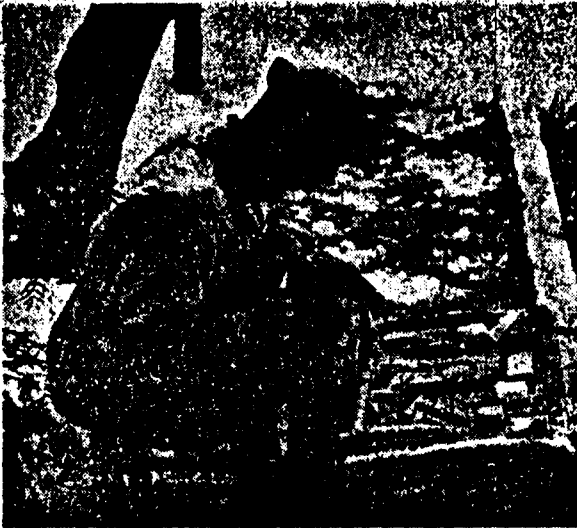
All beginnings are hard but Beersheba, in the Negev, is a place with vast opportunities. This Bulgarian shoemaker has set up his workshop under a shady tree in one of the city's streets.