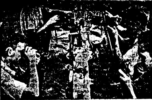
The high skill of Israeli workers is made good use of in the diamond industry in the country.

EVER SINCE THE ISRAELI government launched its so-called "austerity program," the topic of "austerity" has been one of the favorite sources of humor in the new state. Some of these jokes seek to give the impression that austerity will last forever, as note: Two little girls, on their way home from school, stopped in front of a smart dress shop to admire one of the latest creations. "Isn't it lovely?" exclaimed one. "Sure is," agreed her wide-eyed companion. "When I grow up, I'm going to have one just like it." "Oh no you're not," retorted the other. "Haven't you heard of austerity?"