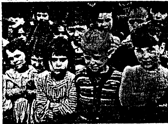
Children in the Grand Camp d'Arenas in Marseilles soon to end their long wandering by going to a country they can call their own, Israel.

are a colorful lot imbued with an indescribable fervor and spirit. Particularly attractive are the children and one marvels at their beauty and seeming health knowing their background of squalor, poverty and suffering.