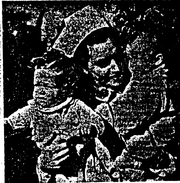
These tiny tots in a reception camp in Israel find shelter in the arms of a nurse.

Britain's efforts to woo Israel, Washington will about-face and stop pressuring Israel. A Washington about-face would backfire against Britain but would also further the interests of both Israel and the U.S. and contribute to stability in the Middle East.