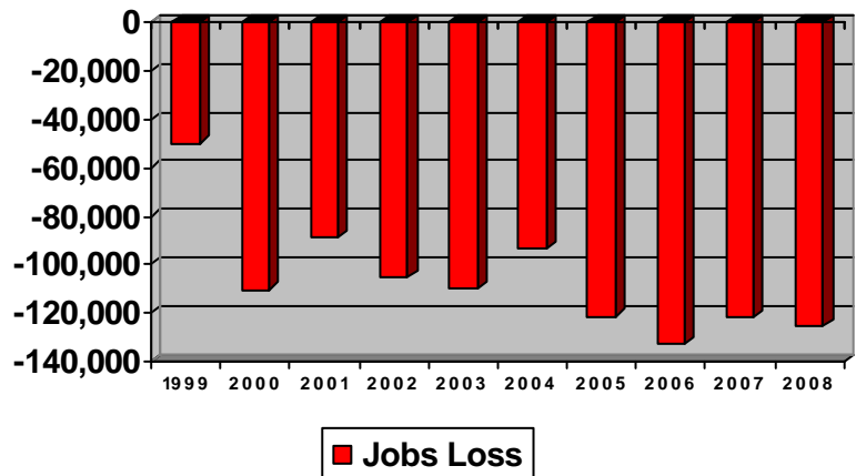
American Jobs lost to UIFTA

Learn more about the movement to suspend the UIFTA, contact the Institute for Research: Middle Eastern Policy (IRMep) in Washington, DC — Telephone: 202-342-7325 — email: info@irmep.org web http://IRMep.org/UIFTA